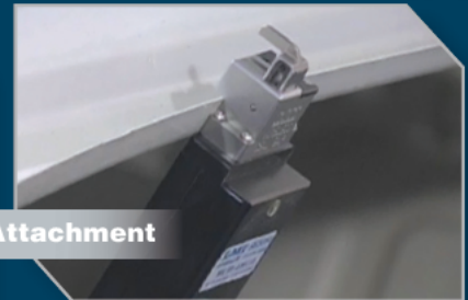
LMI 238W Mini Deck Lid Seal Gap Gauge