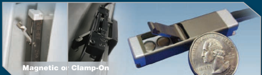
Magnetic or Clamp-On